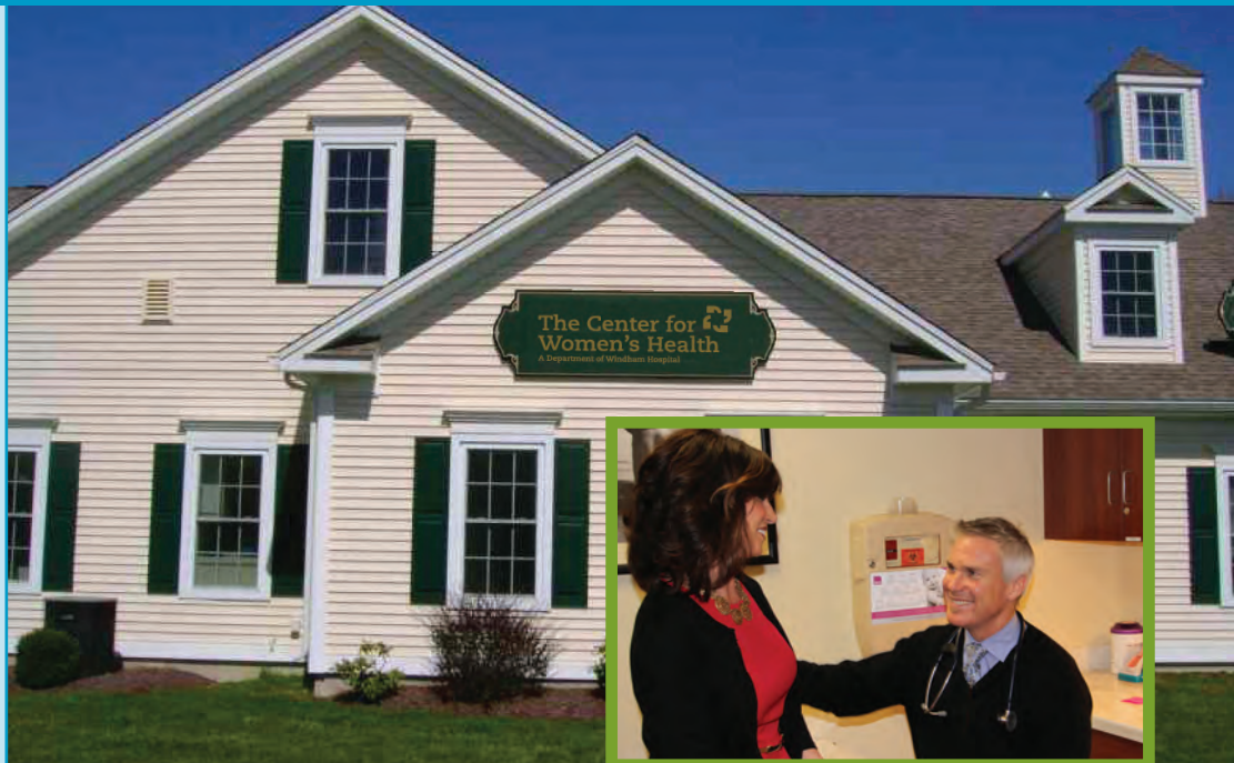
Pictured: Windham Hospital's new Center for Women's Health in Hebron